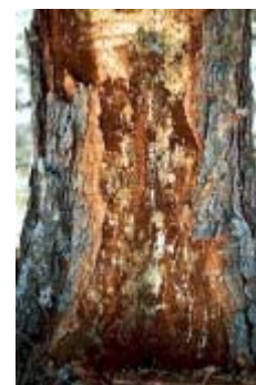
Figure 4: The irregular shaped vertical galleries produced by this beetle are 1" wide and a few inches to several feet in length.