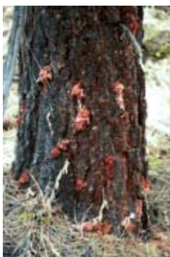
Figure 2: Reddish-white pitch tubes at the base of a pine are the first sign of red turpentine beetle attack.